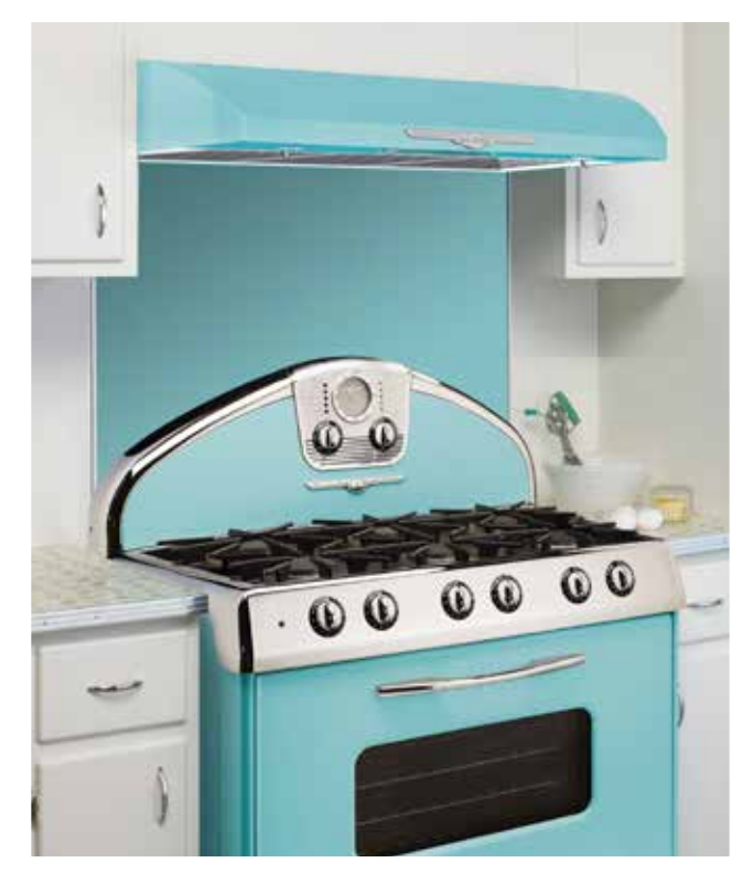
Model 1963 outside-vent hood with Model 1944 36" splashback and 1947 Range

Splashback dimensions: 29 \frac{3}{4} " or 35 \frac{3}{4} " wide x 32" high. Can be installed with or without chrome strips (included).