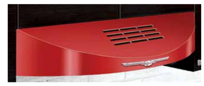
Model 1961 recirculating hood

Featuring 1200 watts of power and capacity of 1.6 cubic feet, the Model 1953 microwave oven is the perfect complement to your Northstar kitchen. Features include sensor reheat, "Genius" sensor cook, inverter turbo defrost, popcorn button, "Keep warm", "Quick minute" and child safety lock.