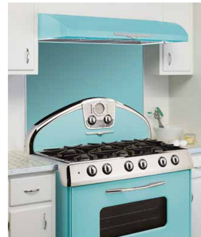
Model 1963 outside-vent hood with Model 1944 36" splashback and 1947 Range

Splashback dimensions: 29 3/4" or 35 3/4" wide x 32" high. Can be installed with or without chrome strips (included).