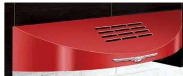
Model 1961 recirculating hood

Featuring 1200 watts of power and capacity of 1.6 cubic feet, the Model 1953 microwave oven is the perfect complement to your Northstar kitchen. Features include sensor reheat, "Genius" sensor cook, inverter turbo defrost, popcorn button, "Keep warm", "Quick minute" and child safety lock.